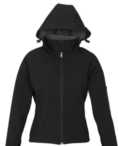
Ladies Summit Jacket