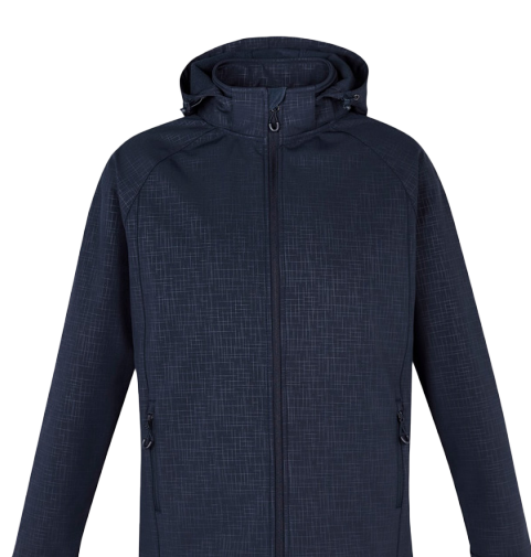
Mens Geo Jacket