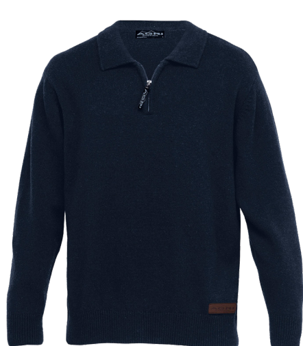
Agri Station Boundary Jersey